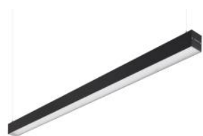
KeyLine suspended L1500, bk