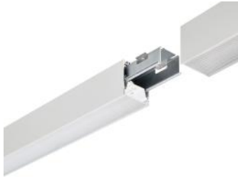
KeyLine alu line coupling with coupling piece accessory