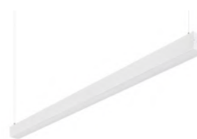
KeyLine suspended L1500, white