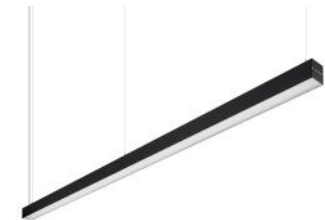
KeyLine line configuration, black