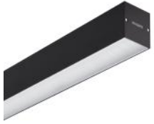
KeyLine black with ceiling bracket accessory for surface mounting