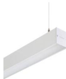
KeyLine alu with end-cap accessory