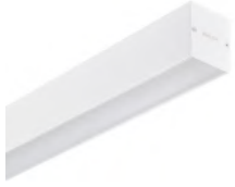
KeyLine white with ceiling bracket accessory for surface mounting