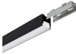
KeyLine black with coupling piece accessory for line mounting