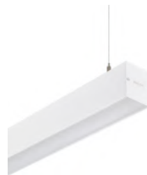
KeyLine white with suspension set for suspended mounting