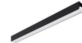
KeyLine SM350C, black