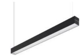
KeyLine suspended L1200, bk