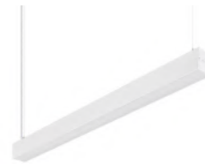
KeyLine suspended L1200, white