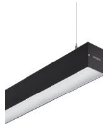
KeyLine black with suspension set for suspended mounting