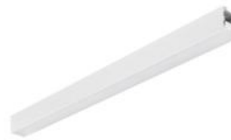
KeyLine SM350C, white