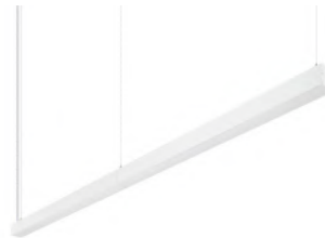
KeyLine line configuration, white