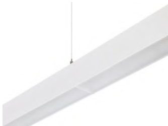
KeyLine line coupling, white