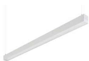
KeyLine suspended L1500, alu