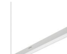
KeyLine - Power supply unit with SystemReady interface, InterAct ready - Medium beam - 74° x 74°