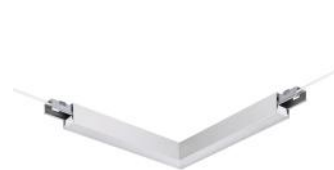
KeyLine L-corner, alu