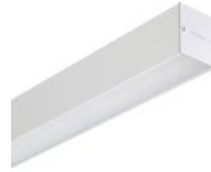
KeyLine alu with ceiling bracket accessory for surface mounting