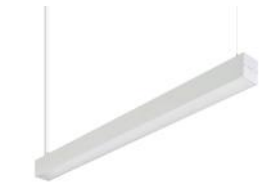
KeyLine suspended L1200, alu