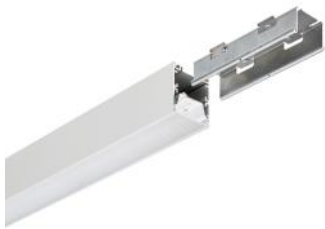
KeyLine alu with coupling piece accessory for line mounting