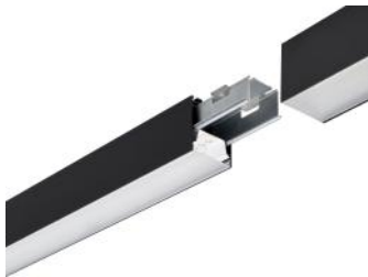
KeyLine black line coupling with coupling piece accessory