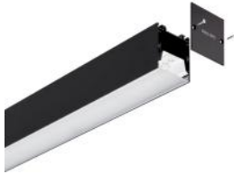
KeyLine black with end-cap accessory