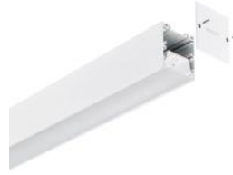
KeyLine white with end-cap accessory