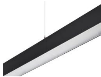
KeyLine line coupling, black