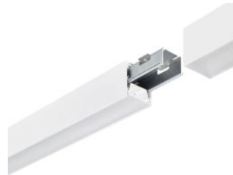
KeyLine white line coupling with coupling piece accessory